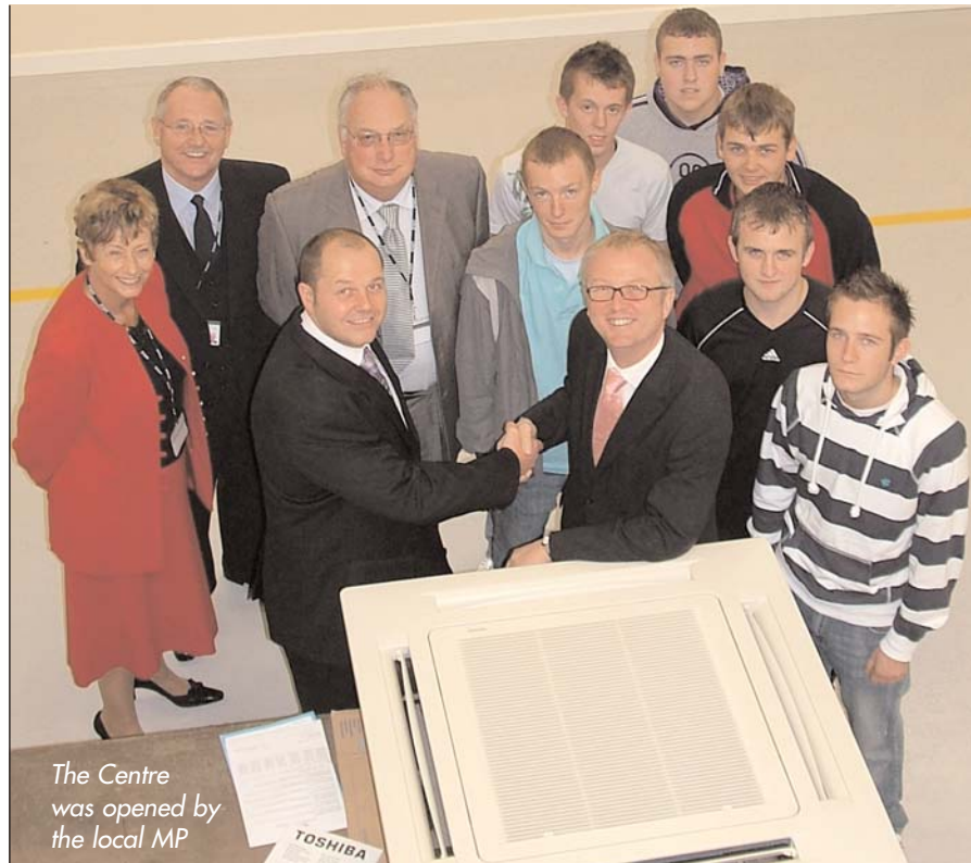
The Centre was opened by the local MP

Toshiba Digital Inverter Split systems Toshiba Mini-SMMS Various control systems