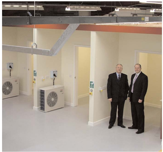
The purpose-built test suites