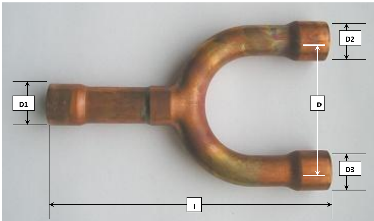
New 5 Series “Y” Shape Branch joint